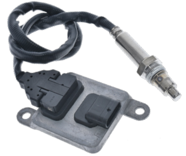
MERCEDES-BENZ WALKER # 1004-1032