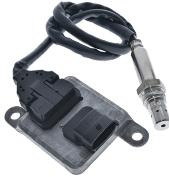
VOLVO WALKER # 1004-1103