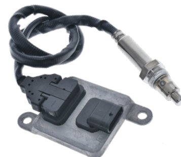
DETROIT DIESEL (DAIMLER) WALKER # 1004-1137