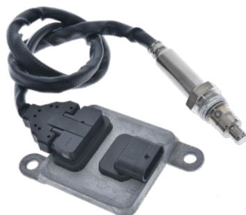
DETROIT DIESEL (DAIMLER) WALKER # 1004-1136