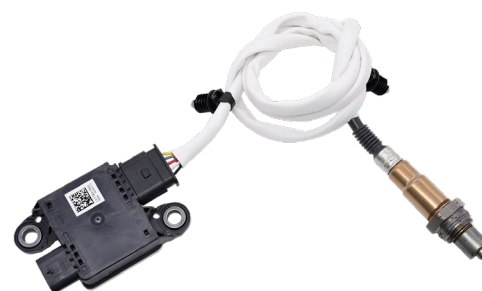
FORD WALKER # 285-10166 2015-2016