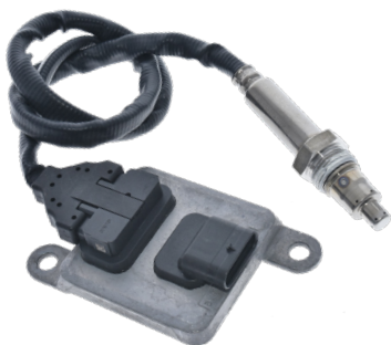
FORD WALKER # 285-10072