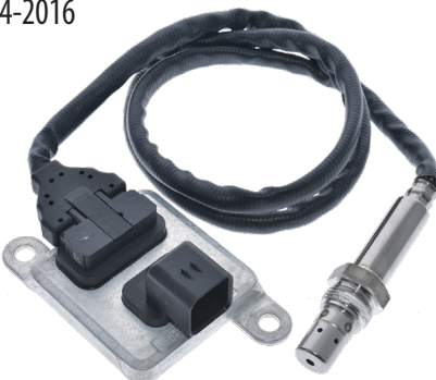
CHEVROLET WALKER # 285-10191 2014-2016