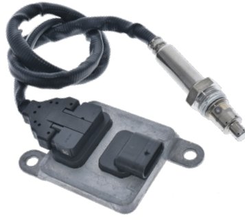
MERCEDES-BENZ WALKER # 1004-1031