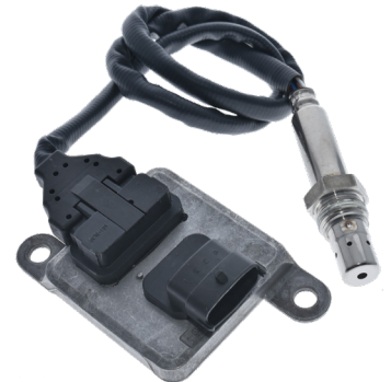
VOLVO WALKER # 1004-1027