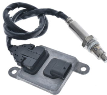
MERCEDES-BENZ WALKER # 1004-1137