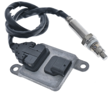
MERCEDES-BENZ WALKER # 1004-1052