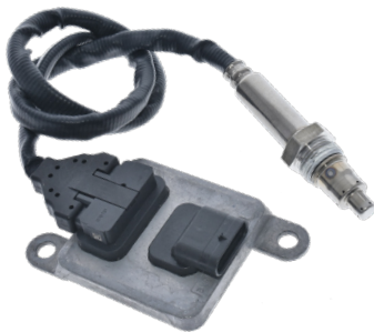
DETROIT DIESEL (DAIMLER) WALKER # 1004-1051