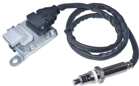
CHEVROLET WALKER # 285-10015 2017-2019