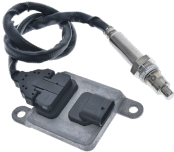
MERCEDES-BENZ WALKER # 1004-1090