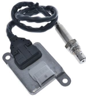
RAM WALKER # 285-10194 2011-2012