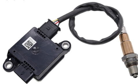
GMC WALKER # 285-10189 2014-2016