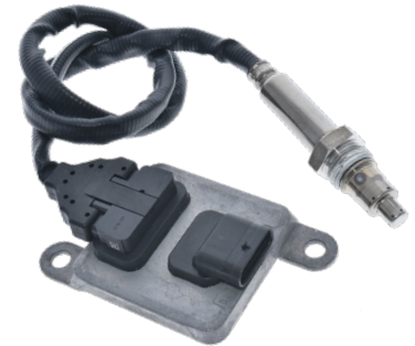
DETROIT DIESEL (DAIMLER) WALKER # 1004-1031