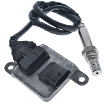
MISCELLANEOUS WALKER # 285-10171