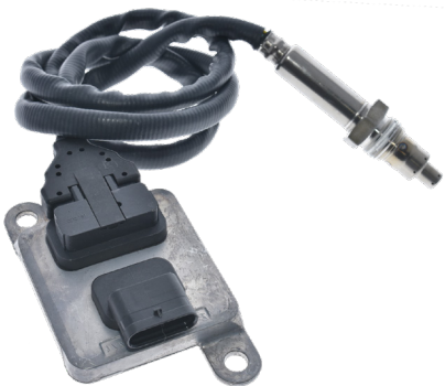
MISCELLANEOUS WALKER # 285-10195