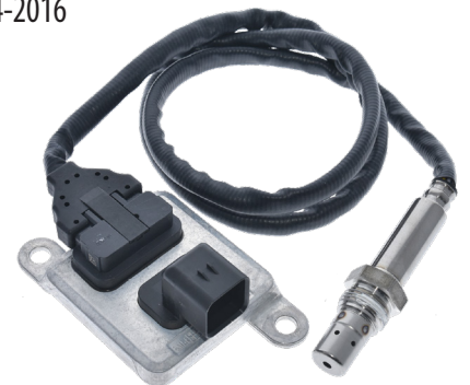
GMC WALKER # 285-10191 2014-2016