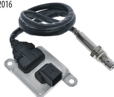
CHEVROLET WALKER # 285-10187 2016-2017