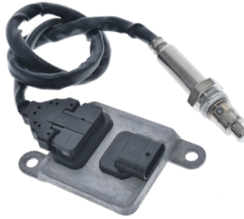
DETROIT DIESEL (DAIMLER) WALKER # 1004-1030