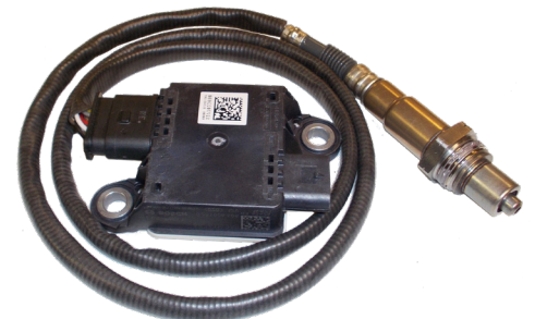
JOHN DEERE WALKER # 285-10172