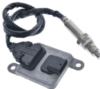
DETROIT DIESEL (DAIMLER) WALKER # 1004-1084