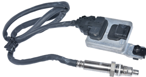
VOLVO WALKER # 1004-1026