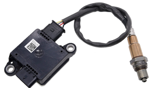
CHEVROLET WALKER # 285-10189 2014-2016