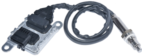
GMC WALKER # 285-10168 2017-2019