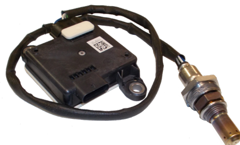
RAM WALKER # 285-10188 2016