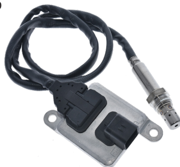
CHEVROLET WALKER # 285-10186 2014-2016