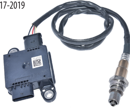
GMC WALKER # 285-10184 2014-2016