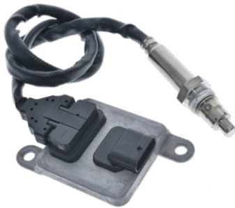
DETROIT DIESEL (DAIMLER) WALKER # 1004-1032