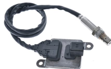
CHEVROLET WALKER # 285-10170 2017-2018