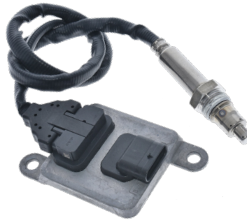
DETROIT DIESEL (DAIMLER) WALKER # 1004-1046