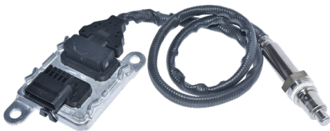
JEEP WALKER # 285-10188 2016