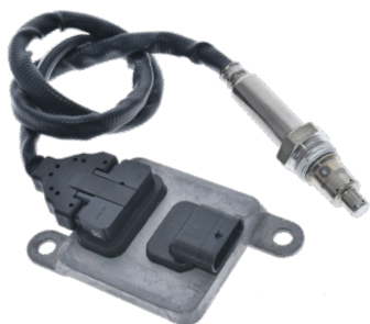
DETROIT DIESEL (DAIMLER) WALKER # 1004-1090