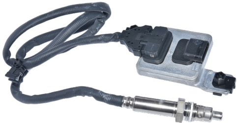
VOLKSWAGON WALKER # 285-10174