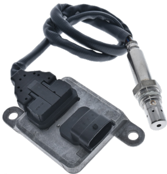
VOLVO WALKER # 1004-1102