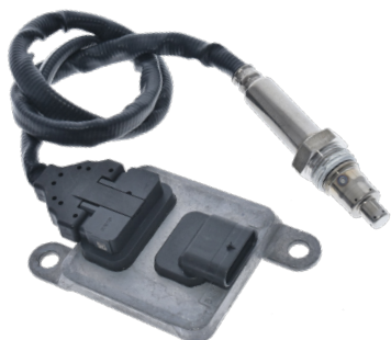
DETROIT DIESEL (DAIMLER) WALKER # 1004-1119