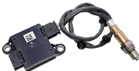
CHEVROLET WALKER # 285-10168 2017-2019