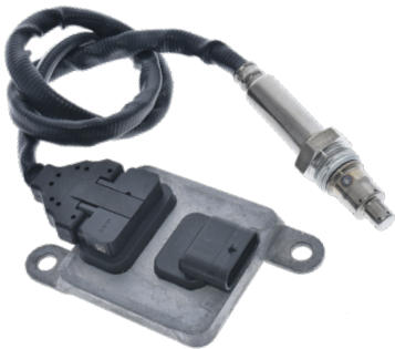
MERCEDES-BENZ WALKER # 1004-1050