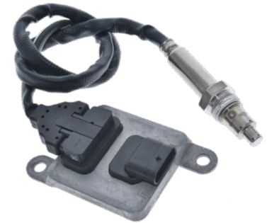
DETROIT DIESEL (DAIMLER) WALKER # 1004-1050