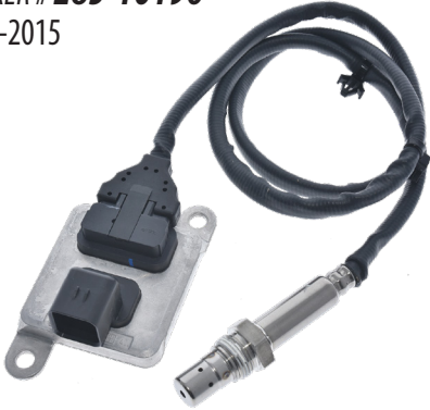
DETROIT DIESEL (DAIMLER) WALKER # 1004-1028