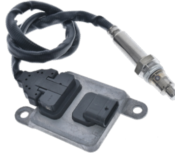
DETROIT DIESEL (DAIMLER) WALKER # 1004-1052