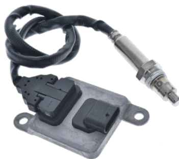
DETROIT DIESEL (DAIMLER) WALKER # 1004-1091