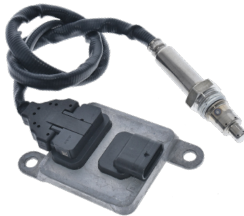
MERCEDES-BENZ WALKER # 1004-1051