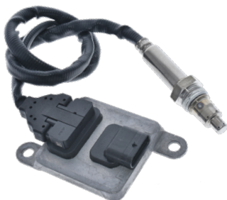
DETROIT DIESEL (DAIMLER) WALKER # 1004-1080