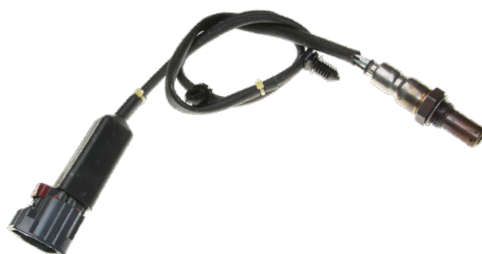
GMC WALKER # 285-10010 2017-2019