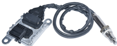
CHEVROLET WALKER # 285-10164 2017-2019