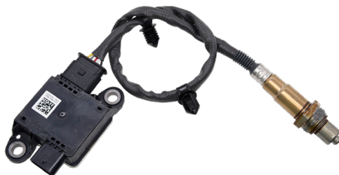
MISCELLANEOUS WALKER # 285-10198