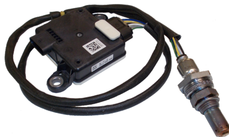
JEEP WALKER # 1004-1028 2017-2019