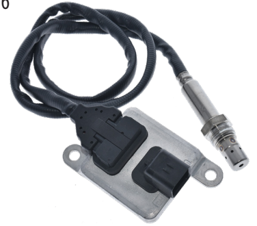
GMC WALKER # 285-10186 2014-2016