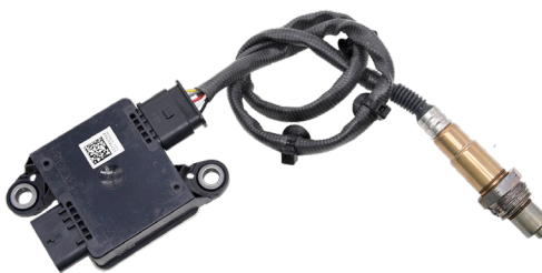
CHEVROLET WALKER # 285-10184 2014-2016