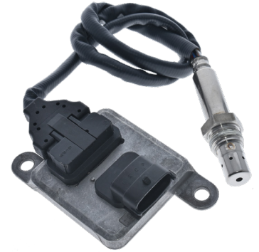
VOLKSWAGON WALKER # 285-10160 2014-2018