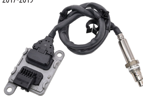
CHEVROLET WALKER # 285-10165