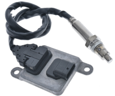
DETROIT DIESEL (DAIMLER) WALKER # 1004-1070