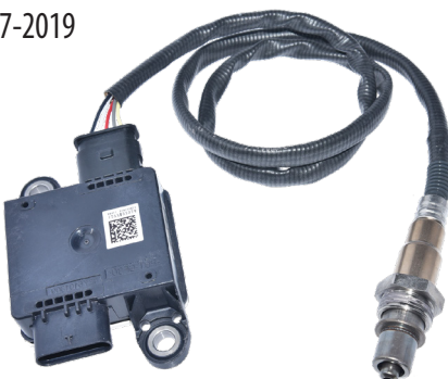
CHEVROLET WALKER # 285-10169 2010-2014