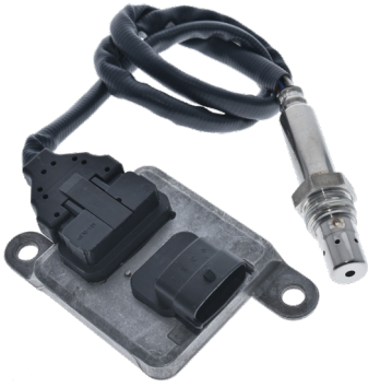
MERCEDES-BENZ WALKER # 1004-1030