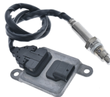
DETROIT DIESEL (DAIMLER) WALKER # 1004-1099