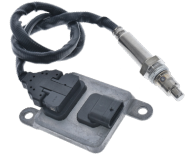
RAM WALKER # 285-10161 2018